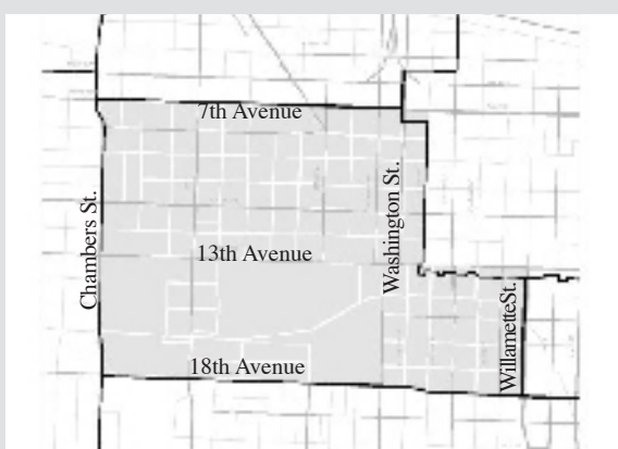
Jefferson Westside Neighbors

If you don't have access to e-mail, you can request that printed information be mailed to you at no cost. Just call 541.344.2552 and leave your name, address and phone number. This service is available only to JWN members.