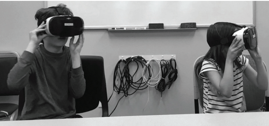
Jefferson Westside neighbors check out virtual reality goggles at the June ECC open house.

infants, toddlers, and preschool age children with delays or disabilities in Lane County each year. Services include parent consultation, parent-toddler groups, specialized preschools, consultation to children in community preschools or child care, and speech, physical or occupational therapy. The new location at 1500 W 12th Ave, formerly Eugene Hearing and Speech Center, is a welcome change for our staff who had outgrown our former location at 299 E 18th Ave. We are happy to have joined Jefferson Westside and look forward to being good neighbors!