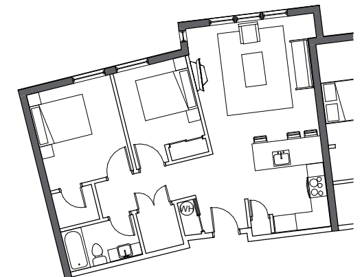
TYPICAL 2 BEDROOM