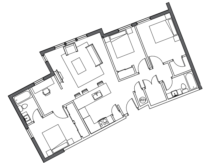
TYPICAL 3 BEDROOM